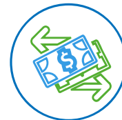
MULTI-CURRENCY EXCHANGE RATES