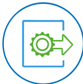
FASTER LC SETTLEMENTS

www.prismERP.net/solutions/lc-management/