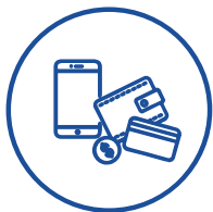
MULTIPLE PAYMENT METHODS

The functional process allows the PrismPOS to be unique from others to maintain financial transactions and from backend system, streamlining the flow of information will keep proper track of sales & stock of your business.