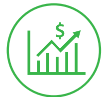
LOW STOCK ALERTS