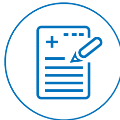
PRECISE ASSET RECORDS