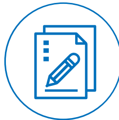
LEGAL DOCUMENTS PROCEDURE