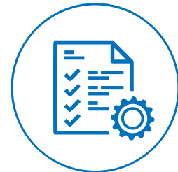
AUTO EMI CALCULATION