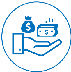
LOAN AGAINST ASSET

www.prismerp.net/solutions/loan-and-investment/