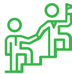
Archiving & Retention