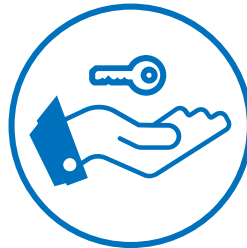
CONVENIENT ACCESS CONTROL