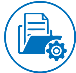
AUTHORIZED SHARING OF DOCUMENTS