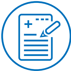
PAPERLESS DOCUMENT MANAGEMENT

www.prismerp.net/solutions/document-management-system/