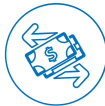
FLEXIBLE PAYMENT METHODS