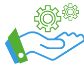
Service Portal Management