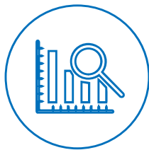
DIGITAL MARKETING PLATFORM