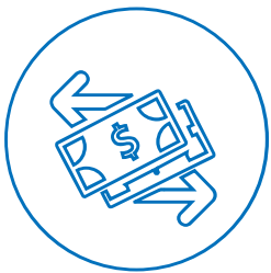
DYNAMIC CURRENCY CONVERTER

www.prismerp.net/industries/money-exchange