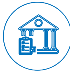
PROPER REGULATORY COMPLIANCE