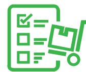
Inventory Control (Stock)