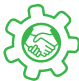
Customer Relationship Management