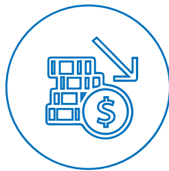
CURRENCY RATE CONTROL