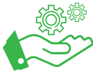
Financial Management System