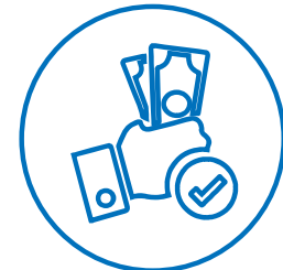
AUTOMATED SOURCE TO PAY SOLUTION