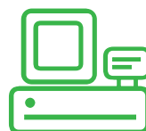
Mobile & Desktop POS