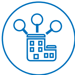
BRANCH & CENTRAL CONTROL