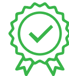
Warranty Management (RMA)