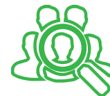
Human Resource Management