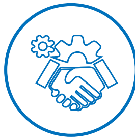
SALES & PROVISION