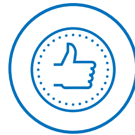
QUALITY & TIME CONTROL