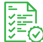
Material Requirement Planning