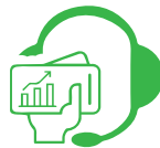
Support Ticketing System