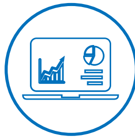
BUSINESS CAMPAIGN CONTROL