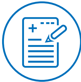
CUSTOMIZED BILLING POLICY