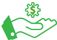
Financial Management System