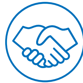
FLAWLESS CUSTOMER SUPPORT