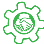
Customer Relationship Management