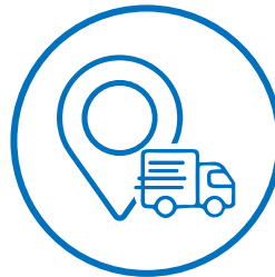
ON-BOARD FLEETS TRACKING