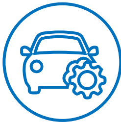
LEASE OR RENTAL BASIS FLEET

www.prismERP.net/solutions/fleet-management/