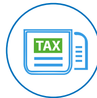
EASES TAX COMPLIANCE