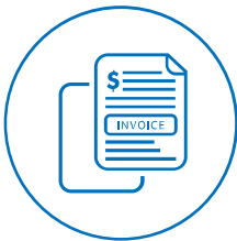
AUTO INVOICE GENERATION