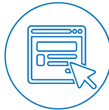
CUSTOMIZED BILLING TEMPLATES