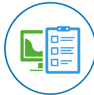
MULTIPLE BRANCH INVENTORIES