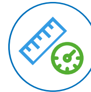
MULTIPLE UNITS OF MEASUREMENT